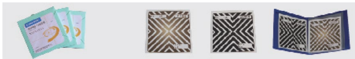
Disposable B-D testing bag